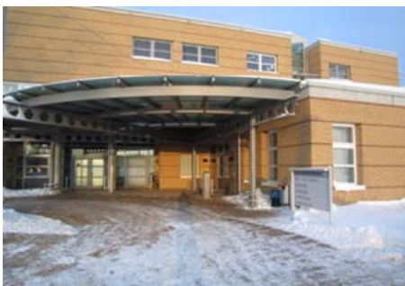
University Hospital of Greifswald in Germany